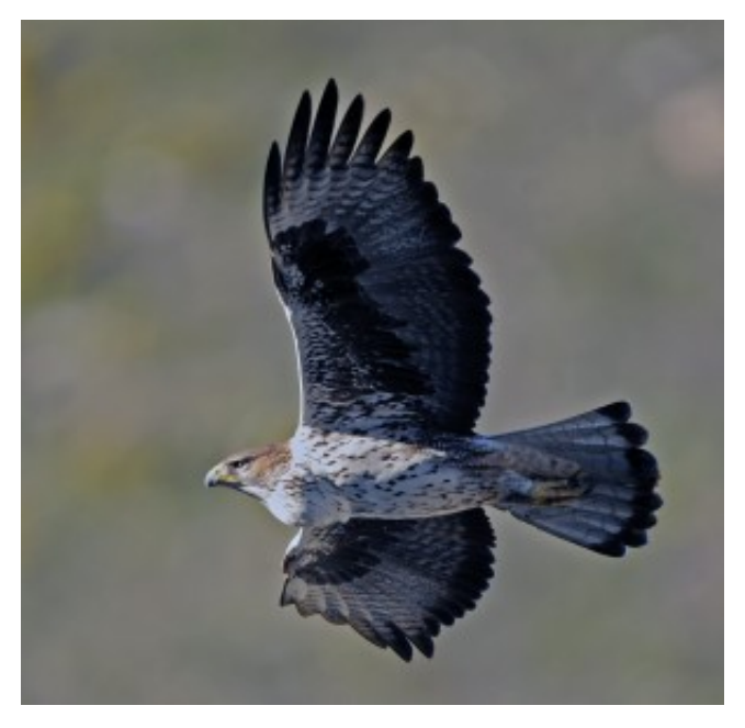
Bonelli's eagle is one of the raptor species Neandertals hunted, presumably for its dark feathers.

did hunt the birds for food, one would expect to see signs of butchery on those bones linked to fleshy parts of the bird, such as the breastbone. Yet the team's study of the bird bones from the Gibraltar sites found the cutmarks on wing bones, which have little meat—a sign that the Neandertals targeted the birds for their feathers rather than their meat.