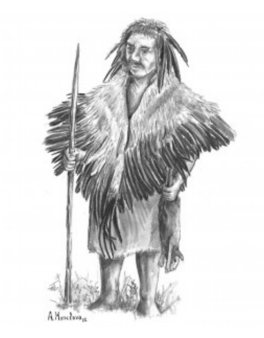
Artist's conception of a Neandertal's feather decorations. Image: Antonio Monclova

GIBRALTAR—Jordi Rosell removes a thumbnail-size piece of reddish-tan bone from a sealed plastic bag, carefully places it under the stereomicroscope and invites me to have a look. Peering through the eyepieces I see two parallel lines etched in the specimen's weathered surface. Tens of thousands of years ago, in one of the seaside caves located here on the southernmost tip of the Iberian Peninsula, a Neandertal nicked the bone—a bit of shoulder blade from a bird known as the red kite—with a sharp stone tool in those two