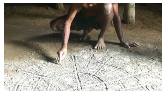
MATHEMATICS NOVEMBER 27, 2023