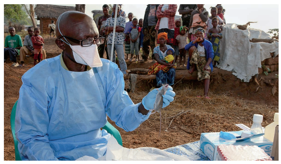
This year, the rats that carry Lassa fever may be more numerous, or more likely to harbor the virus.

As the government and its international partners scramble to set up isolation wards and deliver protective gear to health workers, researchers on three continents are racing to figure out what is driving the unprecedented outbreak. Is it simply better